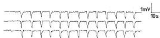
Figure 2. Percutaneous electrosigmoidogram from a normal control subject showing regular pacesetter potentials.