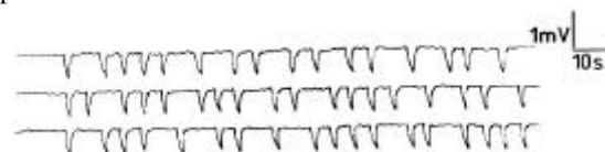
Figure 3. Percutaneous electrosigmoidogram from a patient with ulcerative colitis showing a "tachyarrhythmic" pattern. The pacesetter potentials (PPs) had a higher frequency and lower amplitude and conduction velocity than normal. The PP variables were not the same from the 3 electrodes.

sigmoid familial polyposis, 9 sigmoid cancer patients, 6 patients with sigmoidectomy for sigmoid cancer and 10 healthy volunteers as controls.