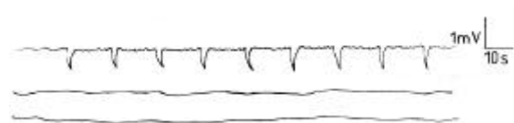
Figure 5. Percutaneous electrosigmoidogram from a patient with sigmoid cancer. Showing pacesetter potentials recorded from the electrode proximal to the tumor but not from the electrodes facing the tumor or distal to it.