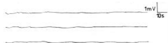
Figure 6. Percutaneous electrosigmoidogram from a patient with sigmoid colectomy showing a “silent” electrogram. No pacesetter potentials were recorded.

and velocity of conduction which differed from one electrode to the other in the 3 electrodes applied to the same subject (figure 4). Their frequency, amplitude and conduction velocity were, in general, lower than normal. This pattern of “bradyarrhythmia” was repeatable in the same patient.