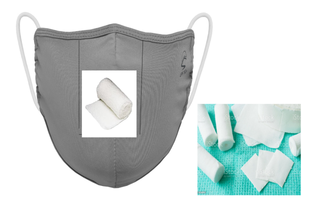
Fig. 2. Example of a prototype face mask for the prevention of SARS- CoV-2 transmission. An ordinary face mask with a pocket covering the mouth and nose area is shown, where a disposable cotton patch ("filter") containing alcohol is inserted. Alcohol can disinfect the virus and other microbes present in exhaled droplets of infected individuals and prevent transmission.

containing a disposable alcohol cotton gauze between the two layers, an alcohol mouth wash and anti-viral nasal spray could decrease viral load body entry, contamination of bystander individuals and in general the transmission of the infection (Fig. 2). It should be noted that the inhalation of small amounts of alcohol are non-toxic and the antiviral and anti-microbial properties of externally used alcohol is widely known [59–61]. Variations of this prototype face mask may include anti-viral drugs and or ethereal oils dissolved in alcohol disposable cotton gauze for wider acceptability and applications, especially if the associated expenses are covered or subsidized by governments or international organizations. The expenditure of such masks is negligible in comparison to testing kits/procedures for SARS-CoV-2 or the treatments currently adopted for COVID-19.