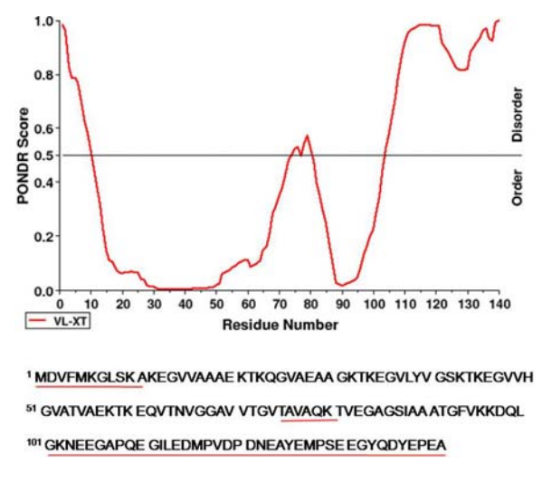
Figure 2. PONDR plot of the predicted secondary structure of alpha-Synuclein. The protein sequence is obtained from NCBI database. PONDR score of 0.5 and higher indicates disordered structures (114). The C-terminal ~40-50 residues in alpha-Synuclein are disordered. The lower panel shows alpha-Synuclein aminoacid sequence, the regions with disoreder propensity are underlined.

Several lines of converging evidence directly implicate alpha-Synuclein in mechanisms underlying the onset/ progression of PD (97). They are: (i) Missense mutations in the alpha-Synuclein gene (A53T, A30P and E46K) cause familial PD in rare kinds (92-94); (ii) Antibodies to alpha-Synuclein specifically detect LBs, (3, 4, 98-104); (iii) LBs purified from PD brains contain abnormally aggregated alpha-Synuclein and insoluble forms of alpha-Synuclein (4, 98). The precise mechanism whereby such aggregates of alpha-Synuclein cause degeneration of dopaminergic neurons is not known. The aggregates may be merely a normal reaction by the cells as part of their effort to correct a different pathological event, as-yet unknown. This issue is dealt with in detail in the latter part of the article.