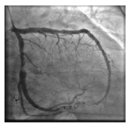
Figure 2. Right anterior oblique view of left coronary angiogram showing ectasia of the left anterior descending and left circumflex arteries. Note the luminal irregularities suggestive of non-obstructive atherosclerosis.