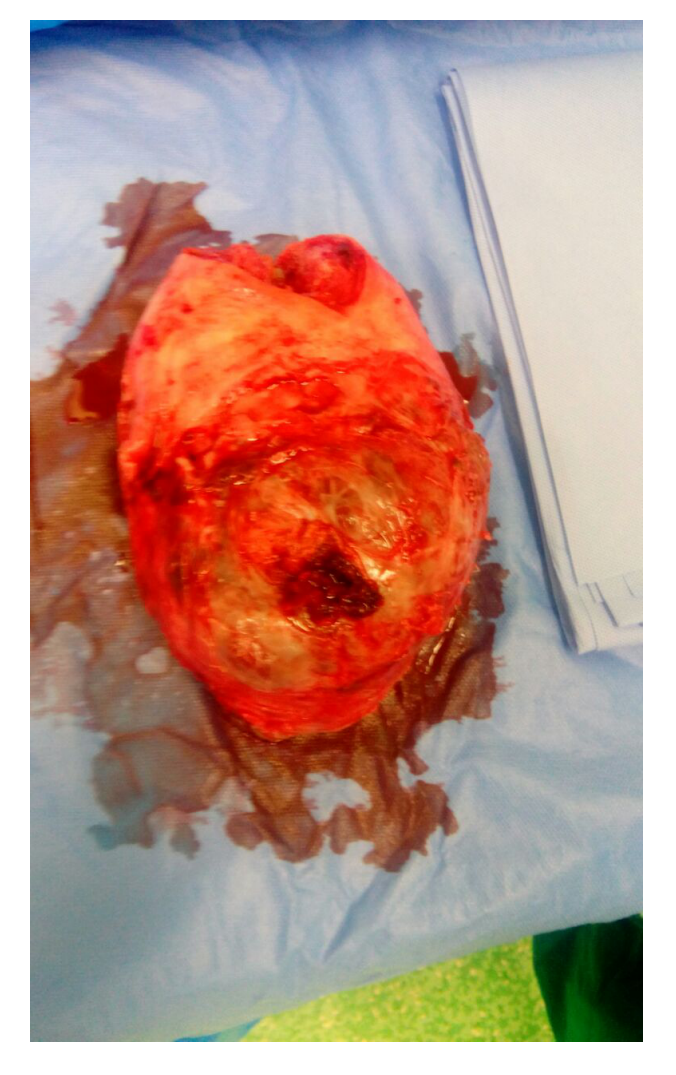
Fig. 3. Demonstrates a postoperative specimen of post hysterectomy showing placenta increta.

In the present study, we found that placenta accreta spectrum cases were 54 out of 90 cases; 16 cases were accreta, 24 cases increta, and 14 percreta.