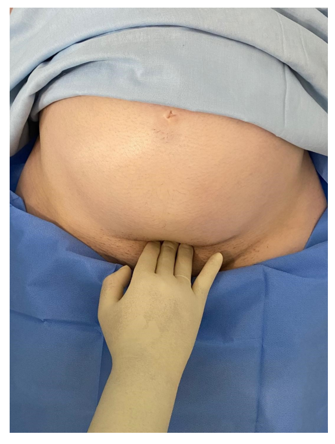
Fig. 3. Application of the Hassiakos maneuver.

The Hassiakos maneuver is based on immediate deep pressure of the pyramidalis muscle for 2–4 seconds, using the three middle doctors' fingers of the right hand, two centimetres above pubic symphysis, with the parturient in a supine position (Fig. 3). The technique is applied after Foley catheter placement and just before skin prep, approximately 15 minutes after neuraxial anesthesia. Prior to the technique, usual testing methods of neuraxial blockade such as temperature examination via cold perception, pin prick or fine touch were performed.