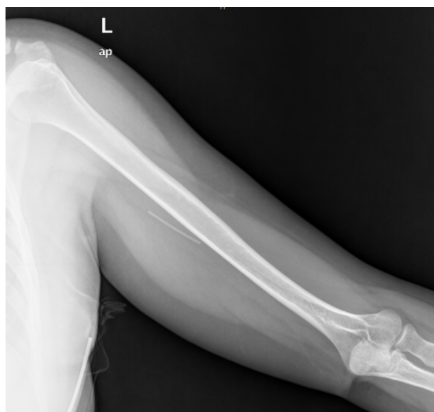
Figure 1. — The initial radiography performed to locate the implant shows the migrated device close to the humerus. A CT scan was subsequently performed to ensure no vascular or nervous structures were affected. Barium sulfate in Implanon-NXT® and Nexplanon® allows their identification using ultrasound, radiography, CT, and magnetic resonance imaging.

away from the insertion site. A 5 cm longitudinal incision was performed on the upper medial side of the left arm, 3 cm from the axillary fold, followed by dissection of the subcutaneous tissue and aperture of the fibrotic capsule. The implant was identified above the humeral artery and the cubital nerve, and was removed with forceps (Figure 2). The wound closure was performed in layers, and intradermal suture was used for closure of the skin. The patient did not develop any post-operative complications.