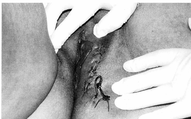
Figure 1. — The perineum of the patient at the end of the procedure. A wide local excision was done through an incision lateral to the labium majus.

definite pathological examination. An incision lateral to the left of the labium majus was performed (Figure 1). Despite the discouraging clinical examination findings the tumor did not infiltrate the pelvic bones and was completely excised (Figure 2). Pathological examination revealed extensive infiltration from neoplastic cells arranged in adenoid cystic formations giving a cribriform pattern consistent with adenoid cystic carcinoma of Bartholin's gland (Figure 3). The amorphous material in the cystic formations stained weakly with PAS. Immunocytochemically the cells were strongly positive for cytokeratins, CEA and actin, and less positive for epithelial membrane